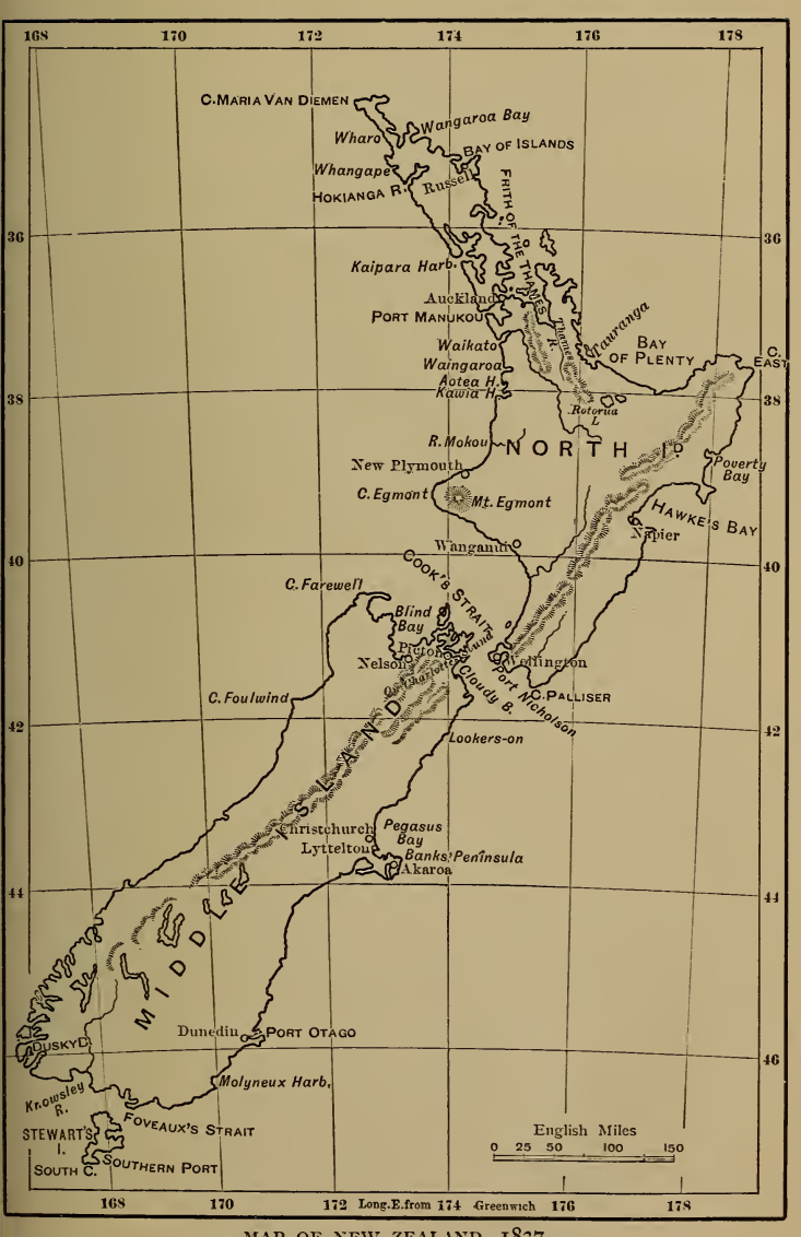
MAP OF NEW ZEALAND, 1837. (Showing progress of settlement up to 1850.)